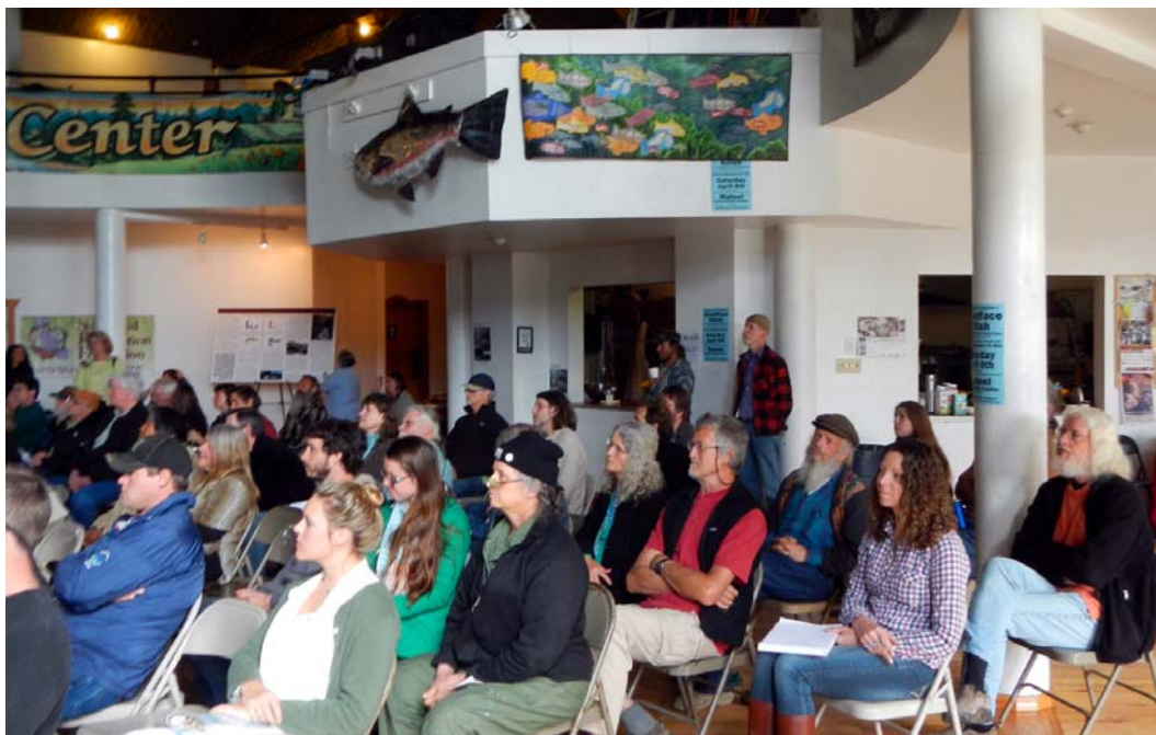
Morning presentations, Water Day March 30, 2013.

There is no charge for admission. Sliding scale donations will be requested for lunch and dinner. Please call 223-7200, if you want to help with Water Day.