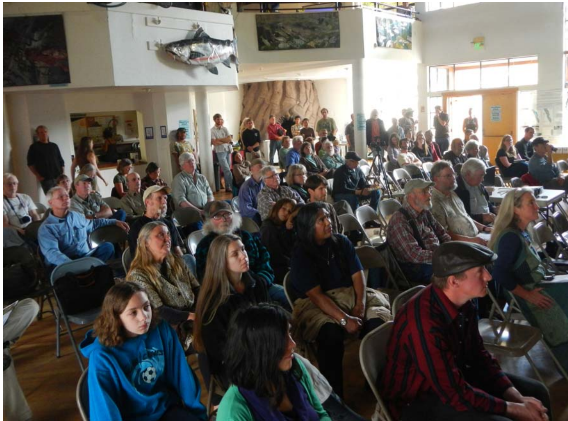
Water Day 2013 afternoon crowd. 3/30/13.